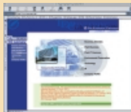
● Official Home Page

This is an engineering ASP (application service provider) site that provides support for the facilities of processing industries throughout their life cycle. Besides distributing engineering applications, we offer procurement services and consultation services.